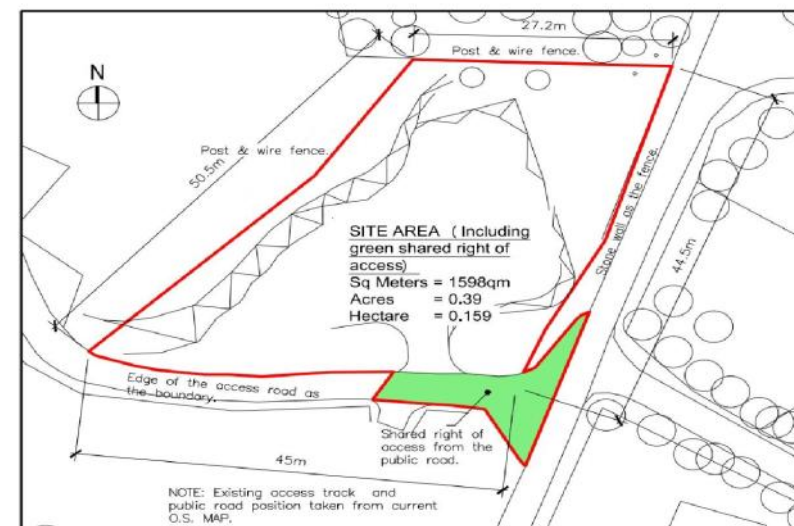
SITE BOUNDARY PLAN - 1:500

Mains water and electricity are on site. Drainage will be by way of septic tank. It is the responsibility of the purchaser to check that all services will be granted and satisfy for themselves that they meet their own personal requirements.