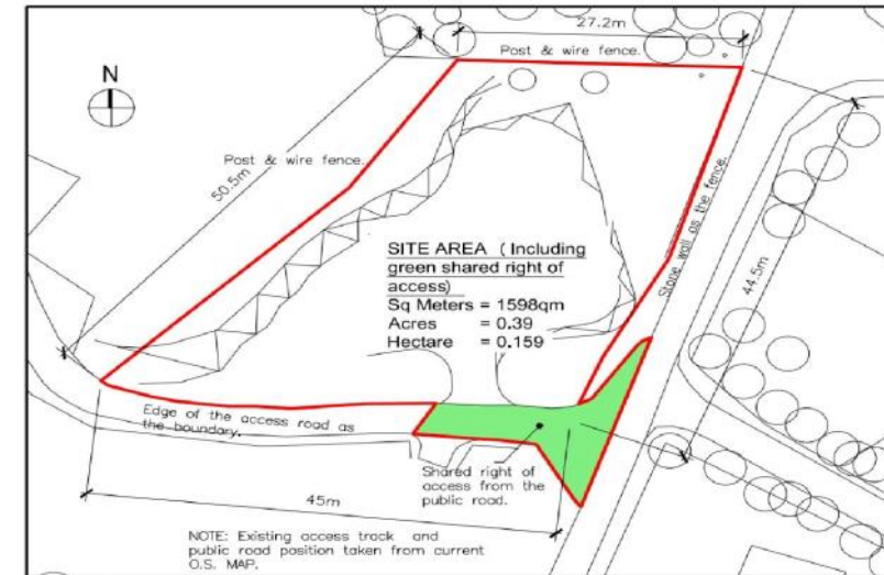
SITE BOUNDARY PLAN - 1:500

Mains water and electricity are on site. Drainage will be by way of septic tank. It is the responsibility of the purchaser to check that all services will be granted and satisfy for themselves that they meet their own personal requirements.